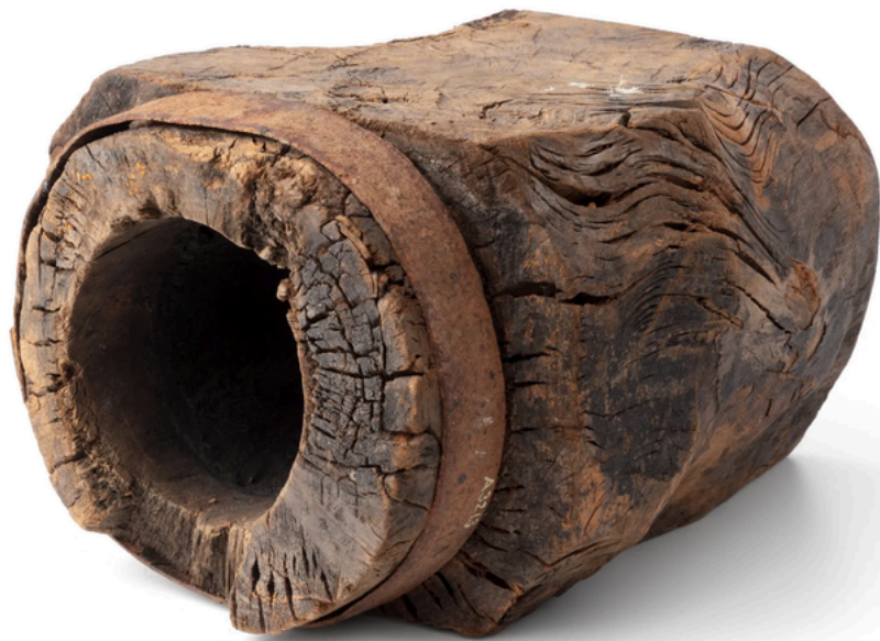
Wooden Water Pipe