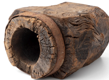
Wooden Water Pipe